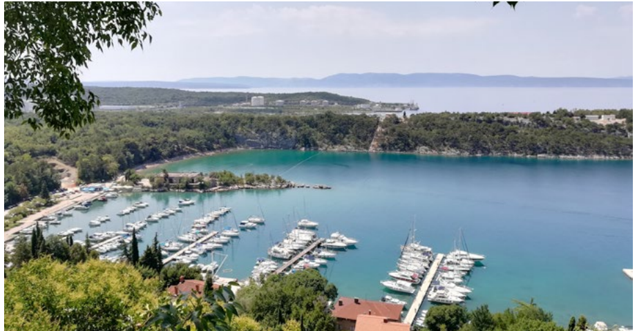
Omišalj view on bay and Dioki industrial site.

At the core of Sanader's story is an alleged EUR 10 million bribe that Ivo Sanader took from the Hungarian energy company MOL to facilitate a favourable deal for the purchase of the majority stake in the Croatian energy company INA, as a part of its privatisation process.