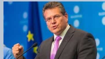
Maroš Šefčovič (TTE). Energy Ministers press conference.