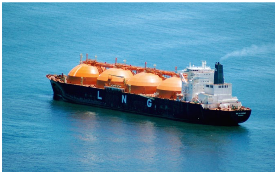
"Golar Frost,"

According to the Croatian government, the proposal for a “two-phase” project is an answer to the difficulties to find investors for the onshore project over the last years. In 2016, the current formula gained traction in Zagreb and was officially presented.