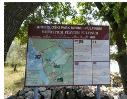
Archaeological site near the Dioki industrial site in Omissalj.

The project was designed as an export-oriented project to contribute to the energy diversification in Central and Eastern Europe, where Russia is the main gas supplier. On various occasions Hungary declared its interest in the purchase of gas from the expected Krk facility. In early October 2018, Hungary's Foreign and Trade Minister, Peter Szijjarto, met Tomislav Coric, Croatia's Minister of Environment and Energy, in Budapest to discuss joint energy projects and gas supplies.