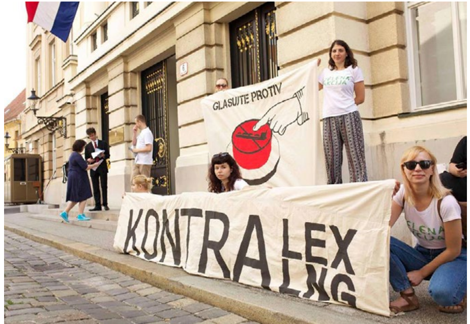
Zelena Akcija action in Zagreb calling on the Croatian parliament to reject the LNG Law.

explored multiple options to realise the project. In 2013, the plan presented to the European Commission was for a Liquid natural gas regasification vessel (LNGRV) - a temporary unit with separate gas deposits that could be used until the onshore regasification plant would be completed. Both options for an onshore and offshore plant were on the table. In 2016, Zagreb officials seemed to favour a Floating Storage Regasification Unit (FSRU) - an offshore project similar to the one realised in neighbouring Italy in Livorno 16 - which had to be somehow combined to another larger onshore LNG unit.