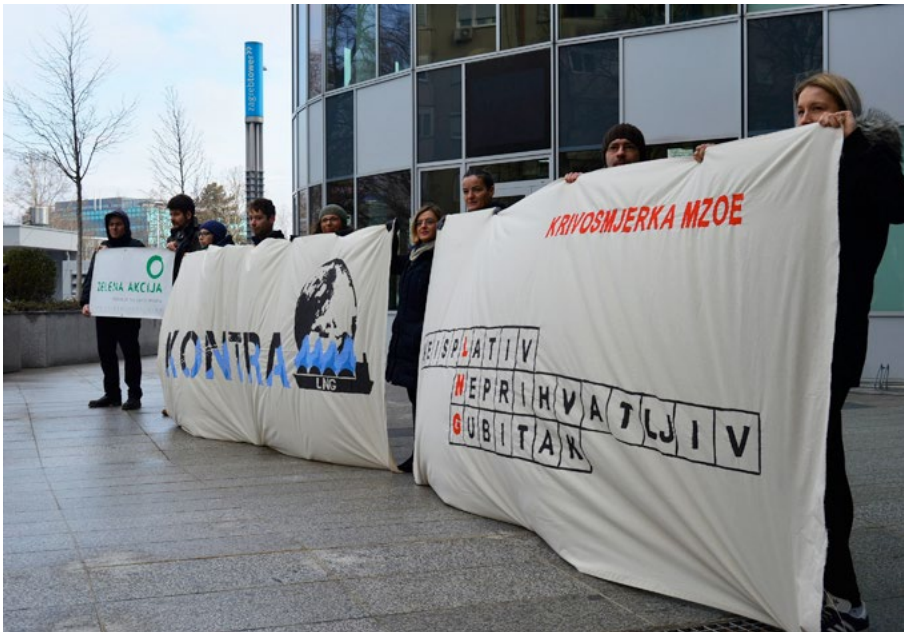
Kontra LNG action in Zagreb in March 2018.

At that point, the land on the Dioki property became completely redundant for the project: only a small piece of land was needed, for the necessary ancillary facilities of the offshore FSRU and a gas pipeline to transport gas to the junction with the international interconnector heading to Hungary. But Nacional highlights that the adoption of the LNG Law de facto allows LNG Croatia to request land for the construction of the first and second phase of the project. Apparently, the company has taken steps to proceed with the expropriation, a move that generated tensions with Gasfin Sa, the foreign investor that just acquired Dioki (see box: Who is Gasfin).