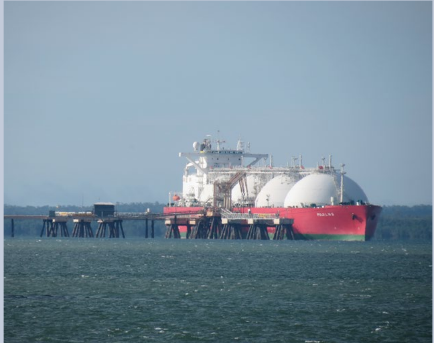
LNG Carrier Fuji Lng

The proponent of the project is the Croatian government through a publicly controlled company set up for the purpose, LNG Hrvatska / LNG Croatia d.o.o. 4 . The proposal is presented as a two-phase project, consisting of an offshore (floating) terminal and an on-shore terminal which would be completed in the second phase of the construction. The terminal is expected to deliver 2,6 billion cubic meters of natural gas in the first stage of the project. Critical voices among media, civil society and experts claim that the two phases are rather two incompatible, separated projects. Both projects are being challenged from an environmental, economic and administrative point of view.