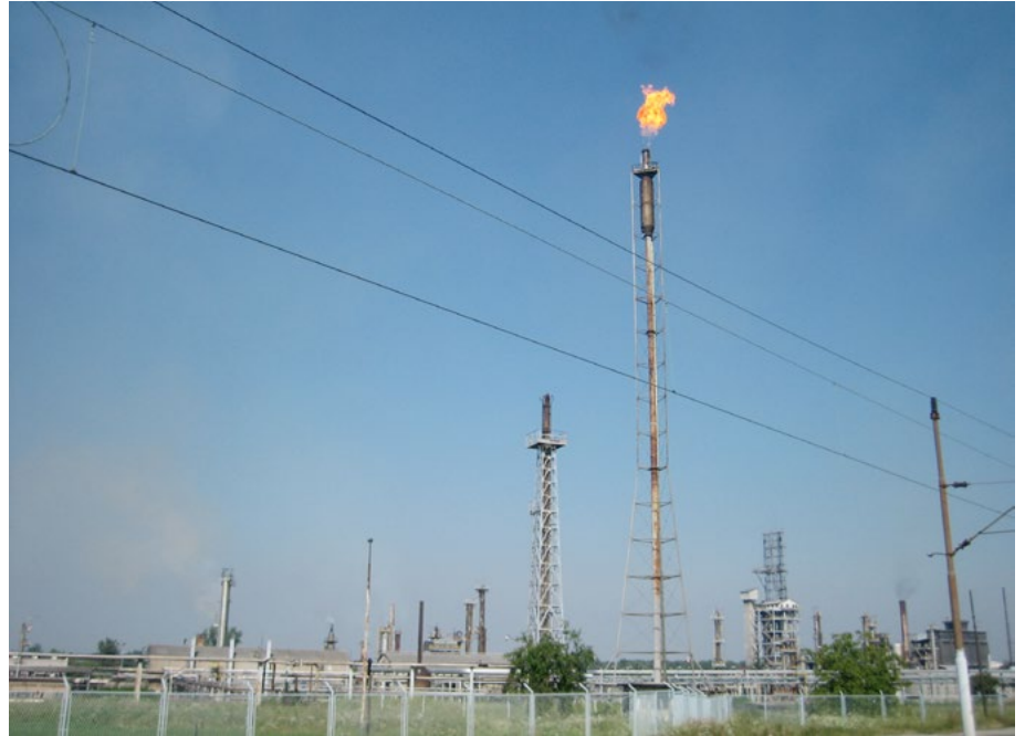
Oil refinery in Sisak, Croatia /INA, photo @ Donatus, wikimedia, CC BY-SA 3.0

Evidence showed that the privatisation process was steered by hidden interests of individuals and political parties that wanted to strengthen their power, get personal benefit and at the same